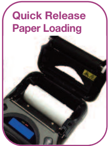
Quick Release Paper Loading