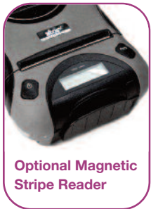
Optional Magnetic Stripe Reader