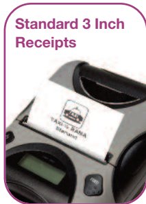
Standard 3 Inch Receipts